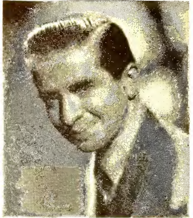
"JOE FRANKLIN'S MEMORY LANE"

"Leave It to the Girls" "At Your Request"