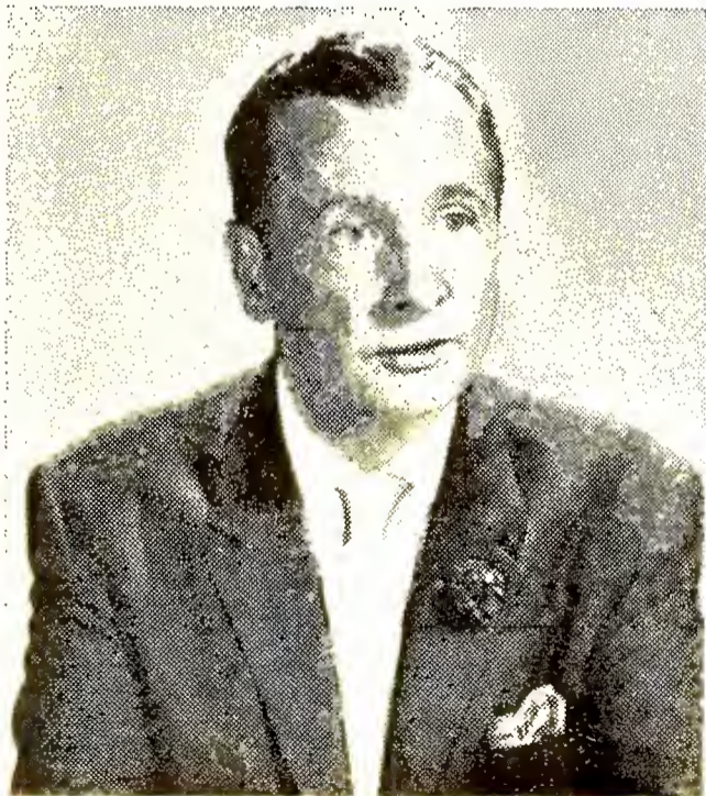
JOHN CAMERON SWAYZE