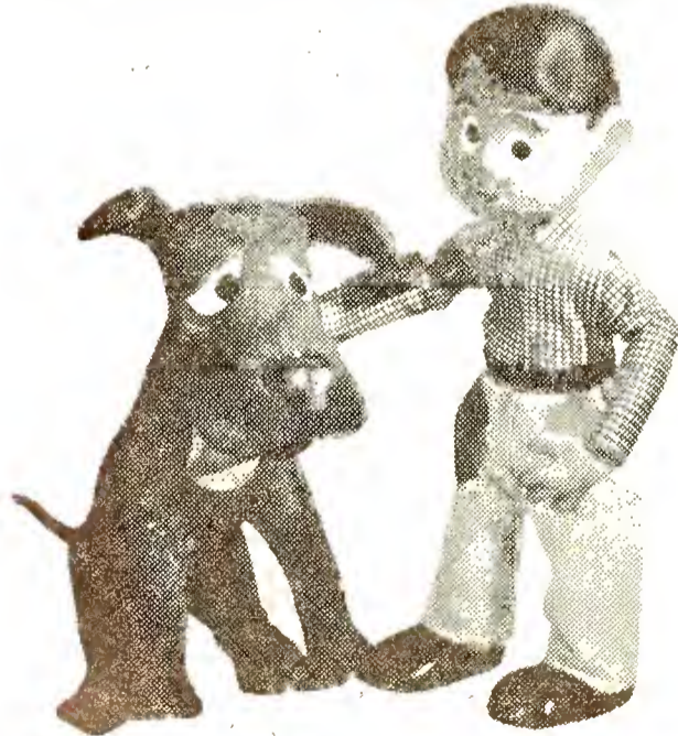
How to schedule DAVEY AND GOLIATH

A TELEVISION PRODUCTION OF THE LUTHERAN CHURCH IN AMERICA